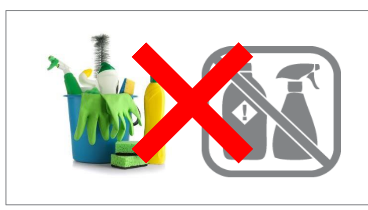
Not suitable if acidity \leq pH 3 or alkalinity \geq pH 9.

Do not use cleaning detergents & chemicals as these can damage the fitting/valve and keg body. Using these are a safety hazard