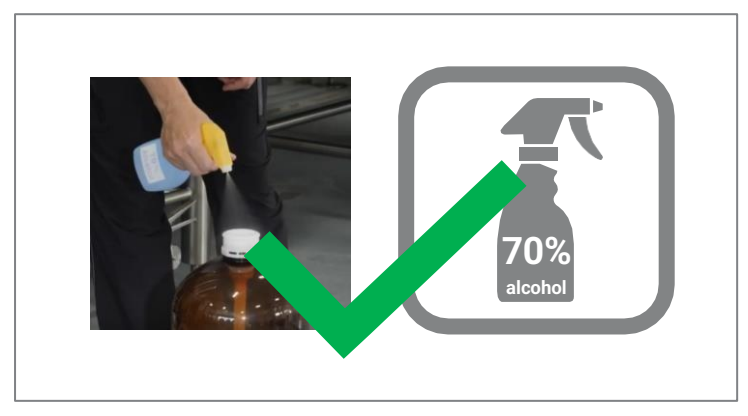
Observe disinfectant exposure times

Not suitable if acidity \leq pH 3 or alkalinity \geq pH 9.